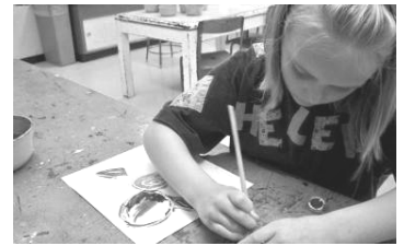
LEARNING ABOUT GEORGIA O'KEEFE FLOWER PAINTING