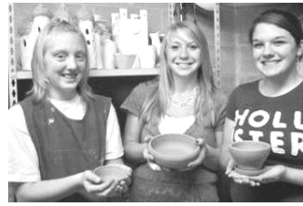
FIRST POTS OFF THE POTTERY WHEEL