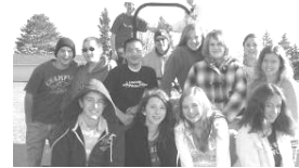
8th Grade Agriculture Education Class completes tractor safety certificate.