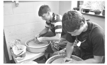
THROWING ON THE POTTERY WHEEL