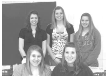
Thank you to the High School helpers who willingly volunteered.

On February 4, families had the wonderful opportunity to participate in a variety of math activities. A few of the activities children were able to do that evening were: build with place value cubes, construct 3-D shapes with toothpicks and marshmallows, sort and graph noodles, play math baseball and Bingo, and make patterns with crackers, cookies, and marshmallows. A math quilt, consisting of 22 math questions, challenged the children to think of how math is related to the everyday world. Math and numbers are all around us!! The following are the questions and answers, along with the individual's names who answered correctly. We had so many smart children AND adults!