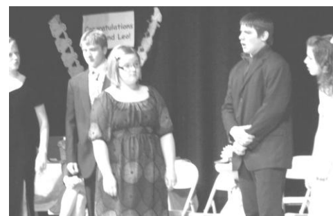
PHS Drama Club production of “Til Death Do Us Part.”